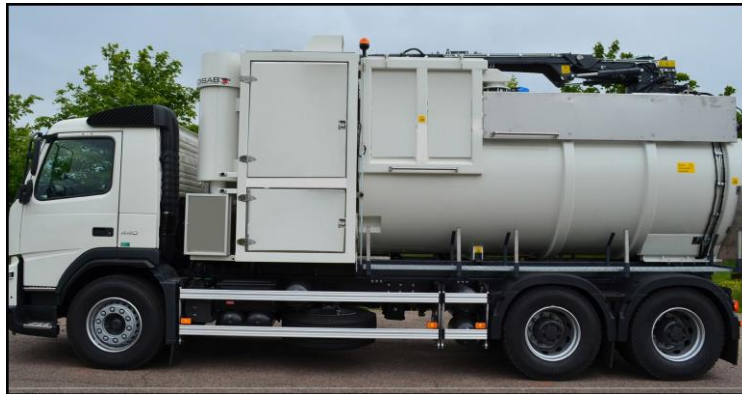
This unit is equipped with options