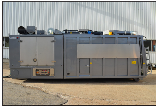
(This unit is equipped with options)