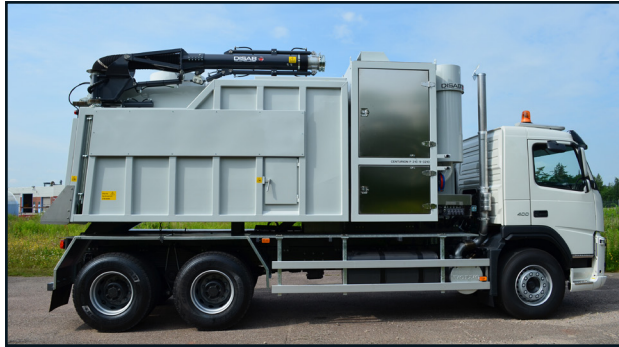
This unit is equipped with options